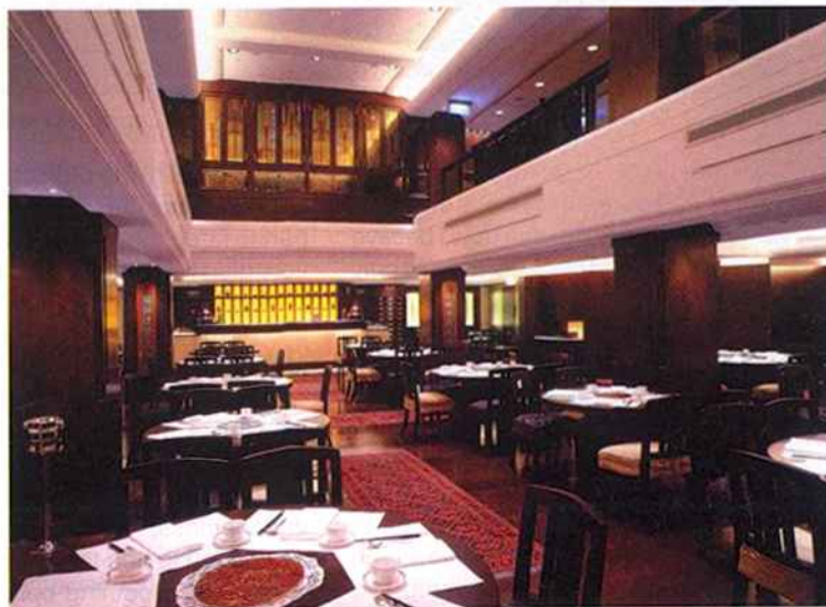
Cantonese dining is taken to the next level at Spring Moon where you can eat food prepared by top chefs in art deco surroundings.

Send the answer in an email titled "Spring Moon dinner" to CCD#SCT before noon on Friday, 14 May. Please include your name, department/port and daytime contact number. The winners will be announced through Daily News.